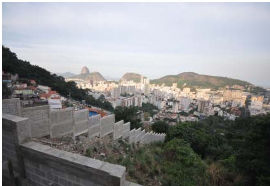
The favela, Santa Marta, was the first in the UPP Program. The formal city is illuminated below and Sugar Loaf is visible in the background.

Only recently has a new program, supported by the city, state and national governments, begun to re-claim the favela territories from the traffickers and militias. The new program, called UPP—Unidades de Policias Pacificadores (Units of peace-keeping police)—began in 2009 and has been successful in the handful of communities where it has been implemented thus far. Police barracks are constructed within the favelas so that the policemen have a full-time presence to keep out the drug gangs. Specially-trained police are assigned to help deal with conflicts and problems in the communities and—in some cases—reinforced concrete walls are built around the favelas to prevent the entry of drug dealers and protect the surrounding forests from expanding settlement.