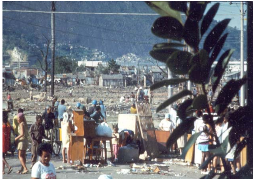
REMOVAL of PRAIA do PINTO

As shown above, the single exception was the decade of the 1970s when more than 100 favelas were eradicated, 100,000 dwellings demolished and close to 700,000 residents displaced. Catacumba, one of the three favelas in which the author lived, was removed in 1970. The author was there in 1969 to witness the eradication of a favela of Praia do Pinto on the opposite side of the lagoon. When the women and children stood in front of their community to prevent the its demolition, the police left, only to set fire to the community during the night. The photograph below taken the next morning shows the devastation as people tried to salvage the remains of their life possessions before being placed in garbage trucks by the helmeted police. 9