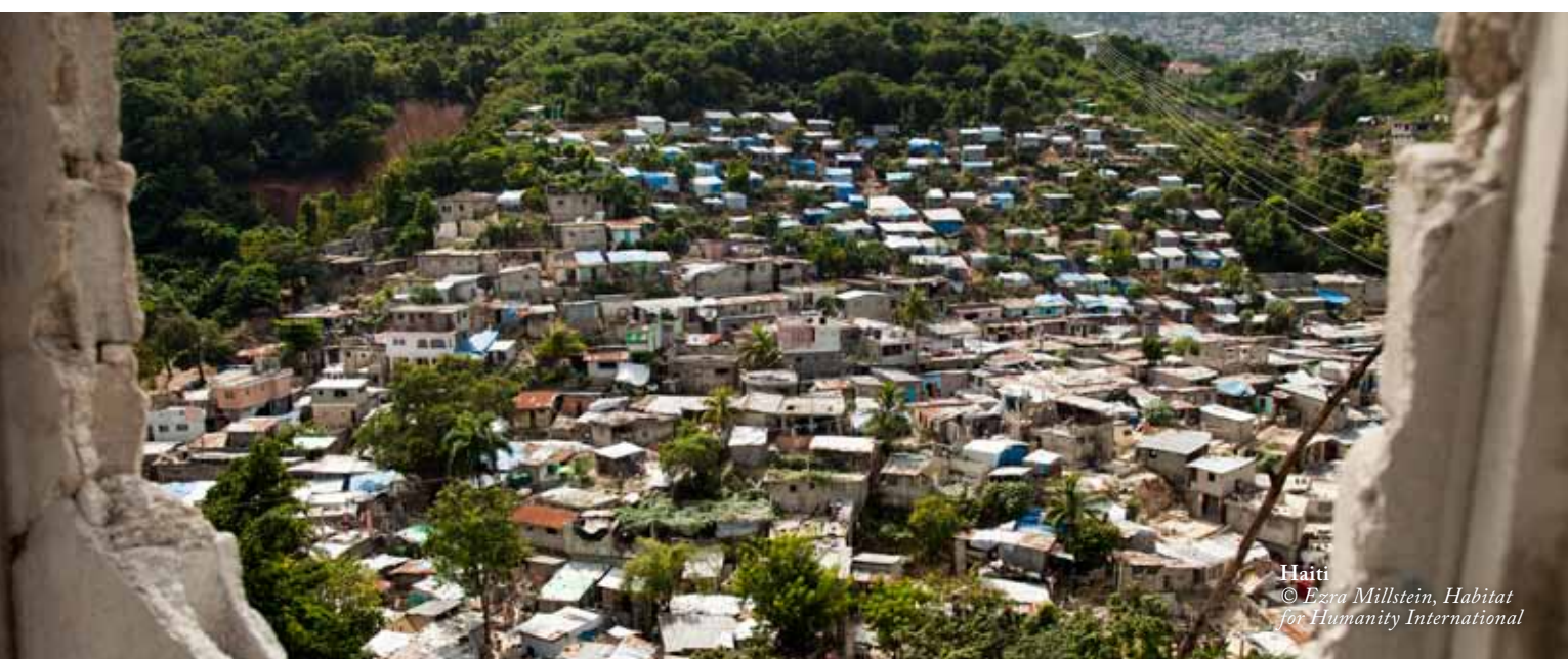
Haiti