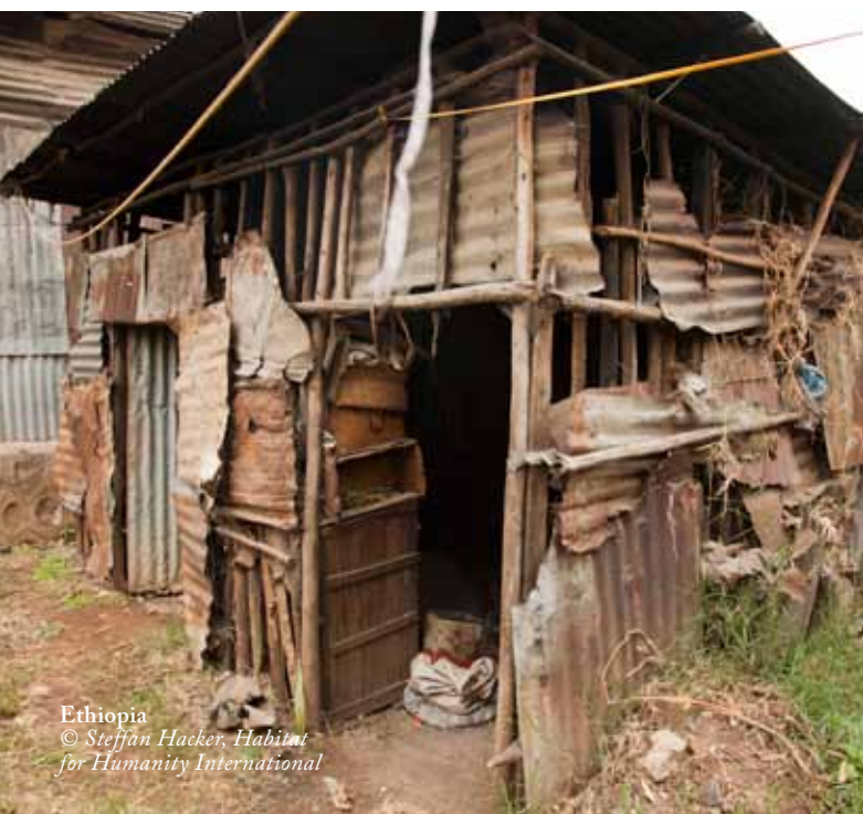
Ethiopia