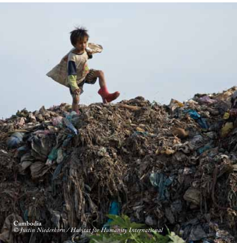
Cambodia